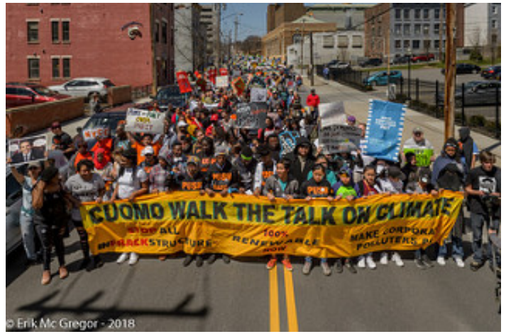
April 23, 2018 Cuomo Walk the Talk Climate March, see article below

PERMITTED STANDARD US POSTAGE PAID ALBANY, NY PERMIT #509