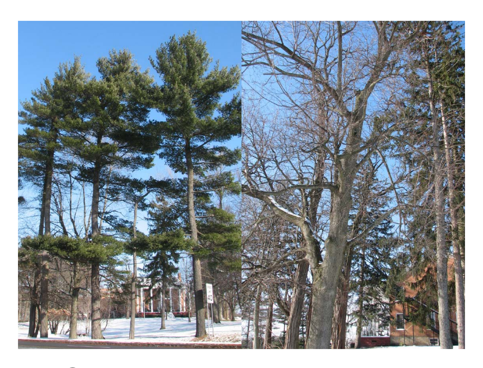
Save the old-growth trees.