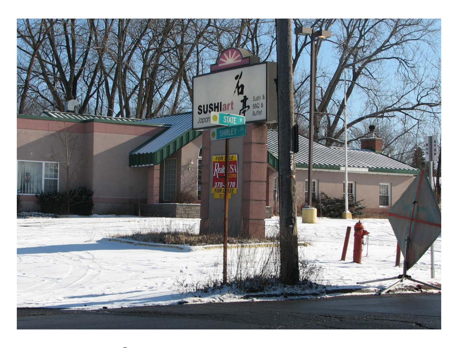
and empty restaurants.