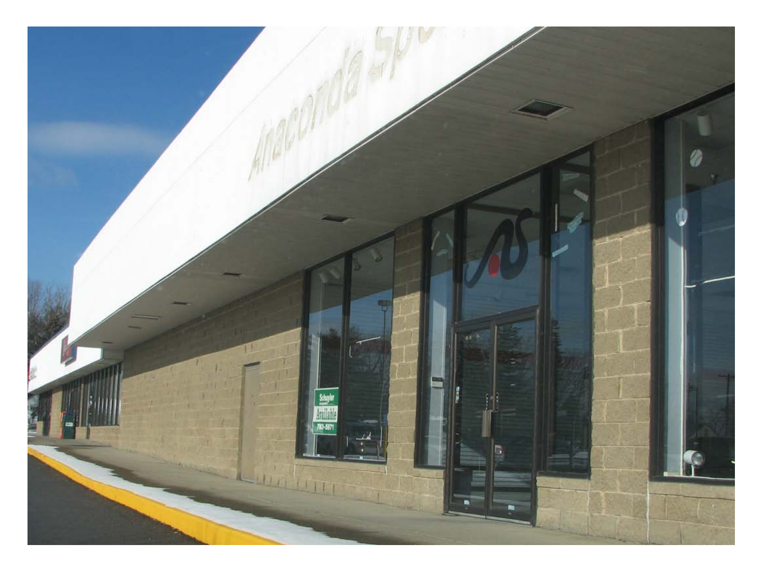
Raymour & Flanigan plaza has empty space.