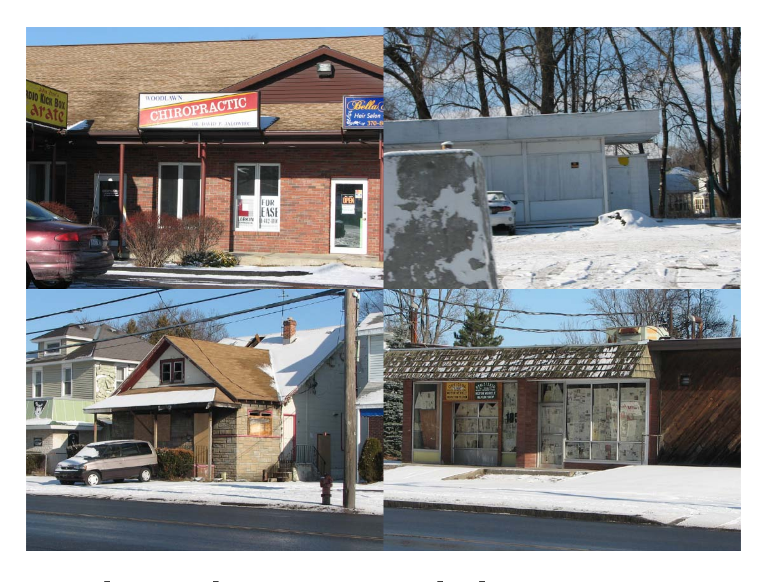
has dozens and dozens...