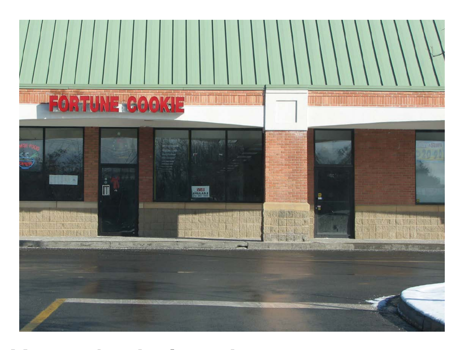
Hannaford plaza has empty space.