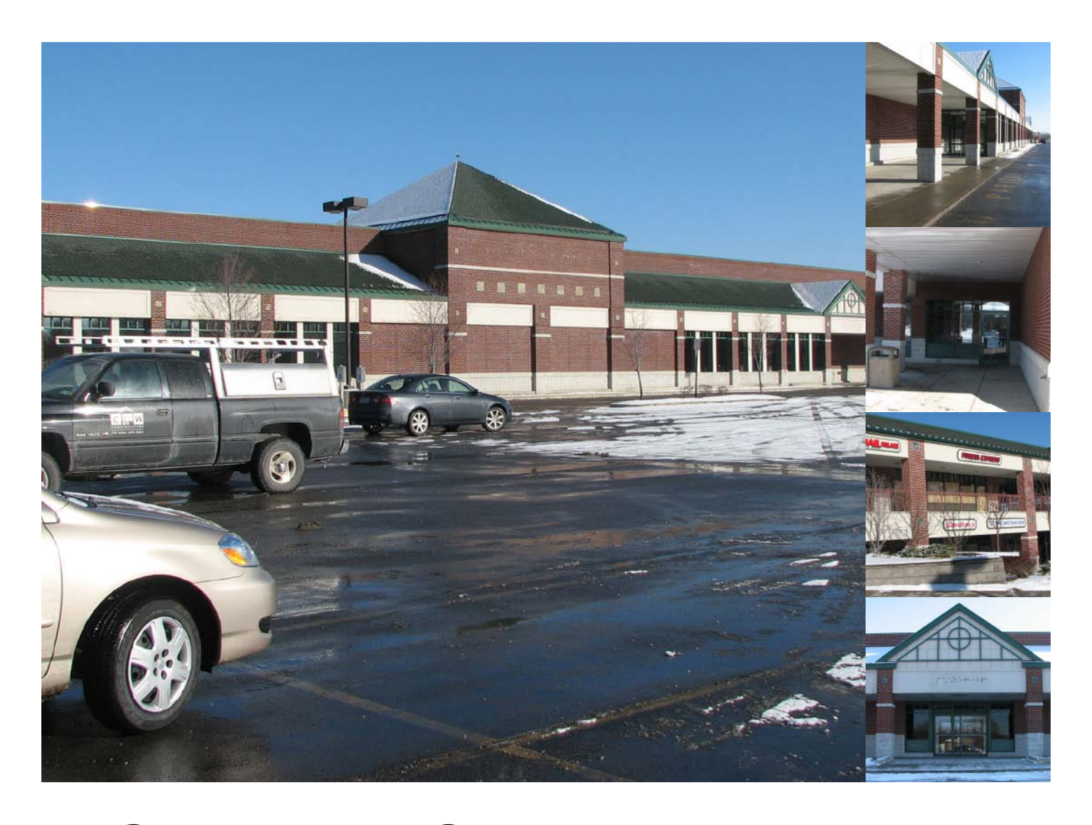
St. James Square sits empty