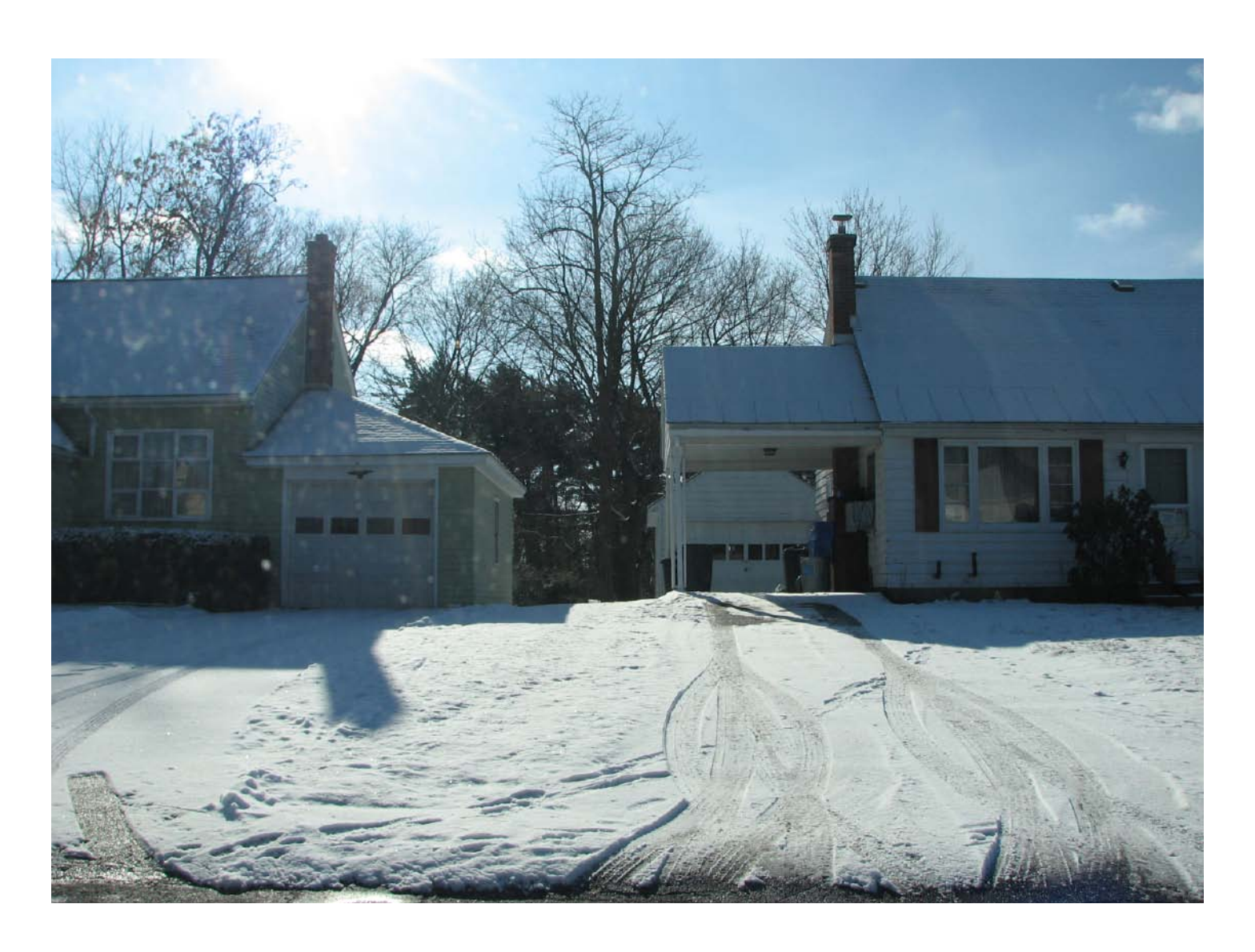
We cherish our neighborhoods.