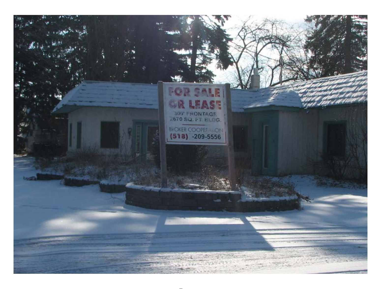
empty retail properties...