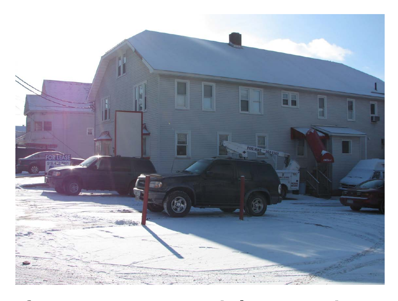
of empty commercial properties...