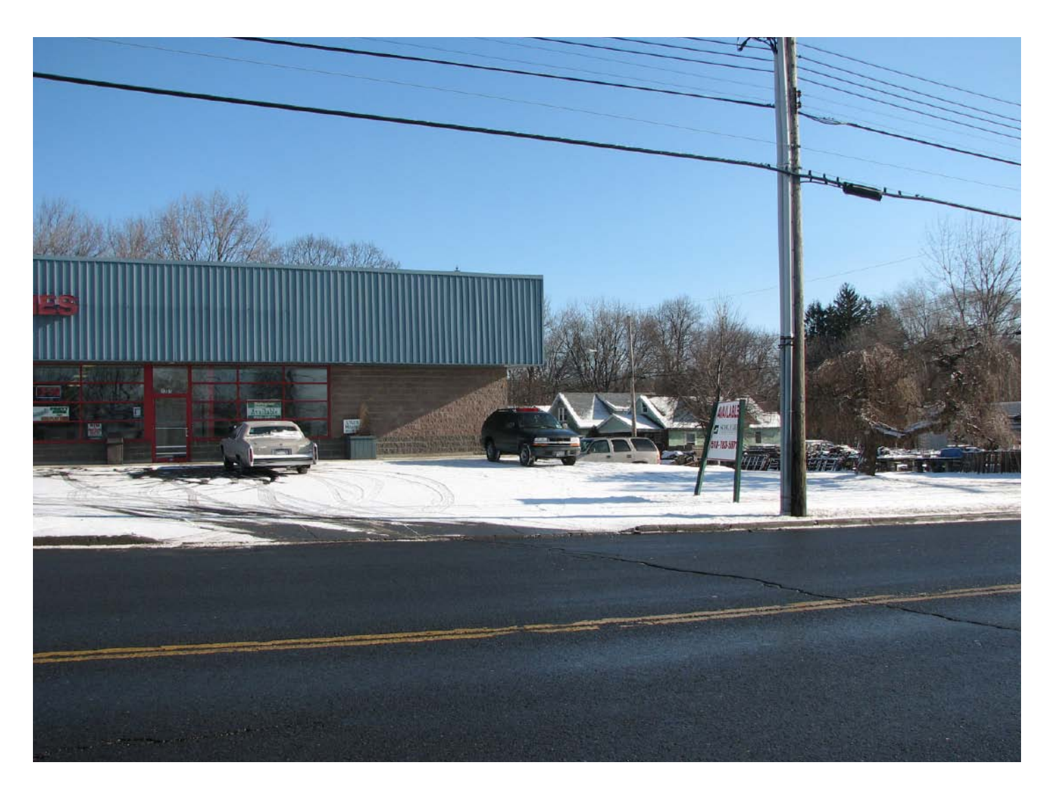
within a mile of the Ingersoll property...