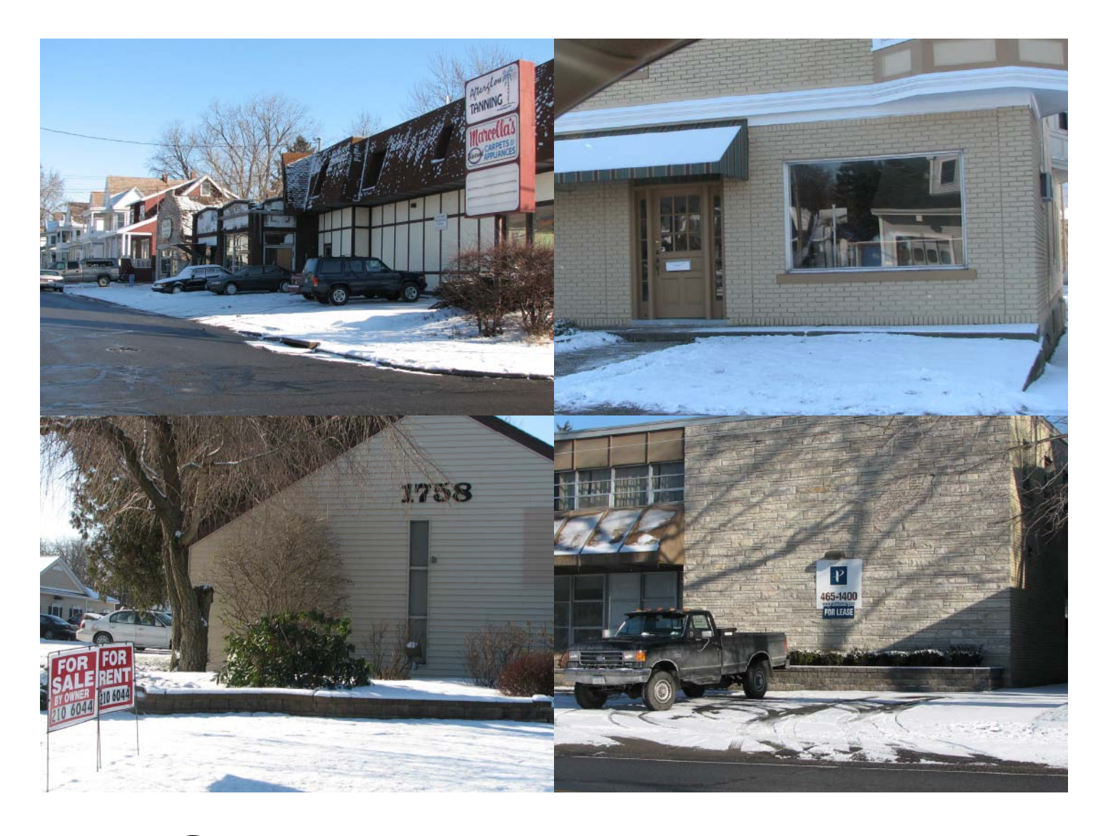
Union Street has long-term vacancies